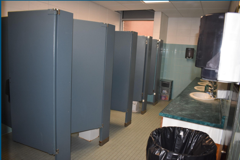
Before (May 2024)